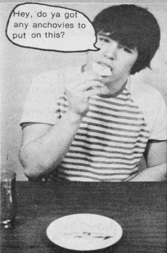
3. Now for a cracker to clear the pallet . . .