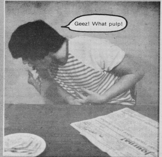
2. . . . and the result