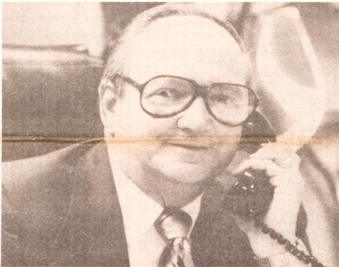
Mayor James Rutherford